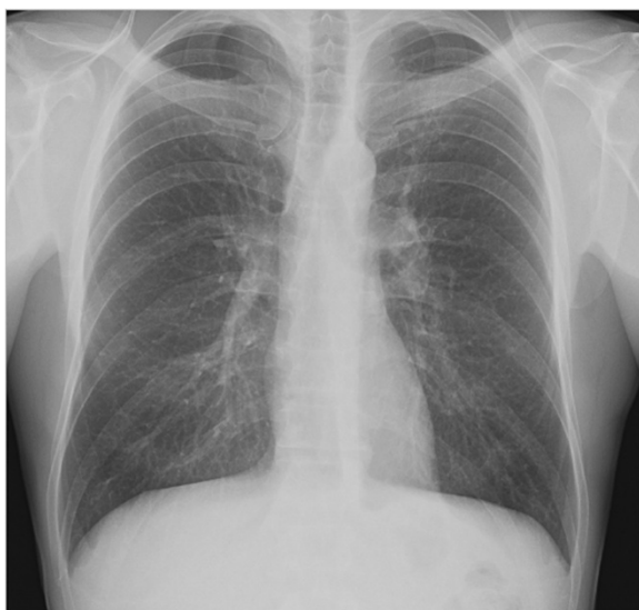
Figure 3 Follow up (post-operative) chest radiograph (PA view) of the patient showing a normal lung parenchyma of the left apex.

[Figure 3]. The patient ceased tobacco consumption since surgery, supported by Varenicline (Champix®, Pfizer, New York, USA). One year follow-up revealed no recurrence, no intercostal pain syndrome and preserved pulmonary function.