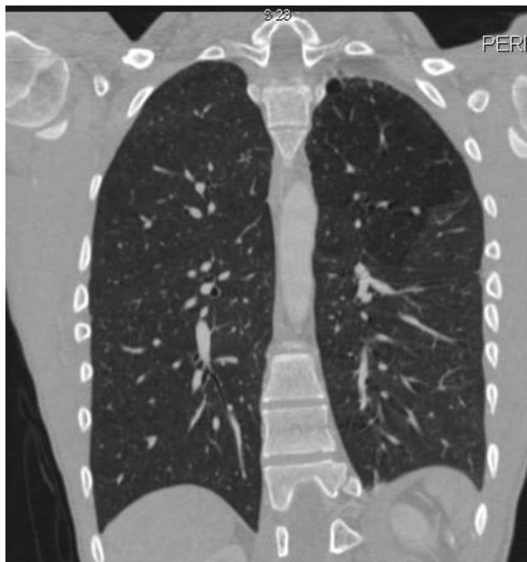
Figure 2 CT scan angiography of the same patient. Note the decreased vascularity of the left lung with hyperlucent upper lobe and presence of apical bulla. The left lung is smaller in comparison to the right.

additional mechanical resistance to flow through the alveolar capillaries and contributes to atrophy of the vascular beds [16].