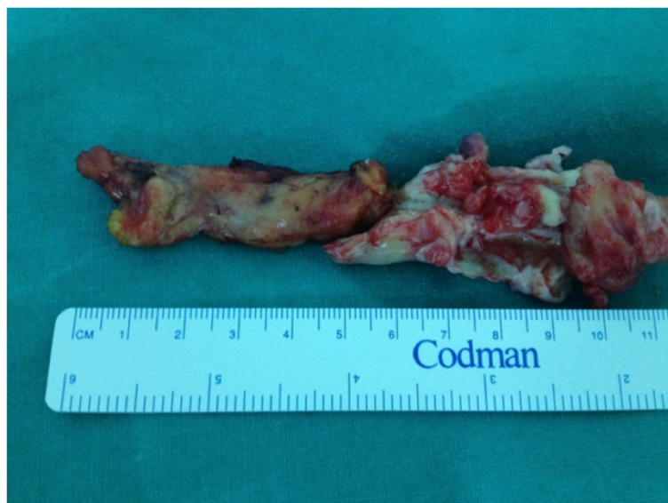
Figure 4 Extracted thrombus.

and after a follow-up period of more than 18 months, 6 of 8 patients were alive and infection-free [17]. They also describe advantages of: less injury to heart structures; less vegetations from blood flow, which might otherwise cause mechanical stress; and the ability to perform concomitant procedures if required [17]. Okada et al. describe their recent experiences of 6 such procedures, with all surviving the follow-up period and one having a recurrence of infection [18]. Abad et al. demonstrate the well-tolerated use of cardiopulmonary bypass amongst seven patients with pacemaker infections; four with Staphylococcus epidermidis , two with Staphylococcus aureus and one Pseudomonas