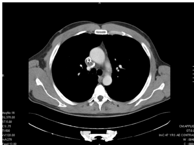
Figure 1 Transverse plane image of contrast-enhanced CT scan demonstrating two pacemaker leads within the SVC.

In the first instance the infected right infra-clavicular pacemaker pocket was opened, the generator was removed and endocardial leads were mobilized. A median