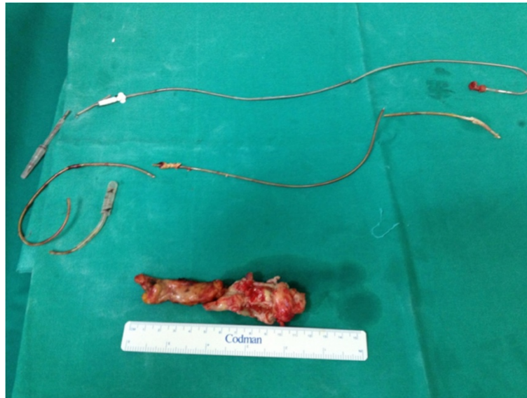
Figure 3 Extracted pacemaker leads.

in situ and conserve its application with excellent short-term outcomes. Long-term data and efficacy for this modality, however, remains unknown. The choice between such procedures and a surgical approach remains unclear, but guidelines suggest that in those with larger masses, surgical extraction remains more desirable [10].