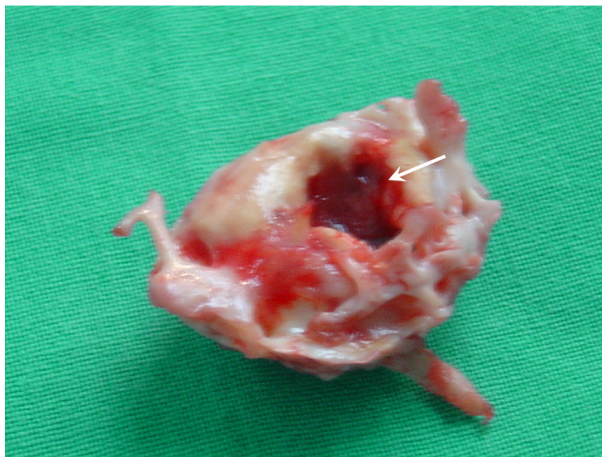
Figure 2 The round shaped calcification specimen with a central crater (white arrow) filled with clot.